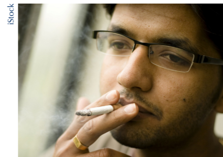
There are 94 million smokers in India