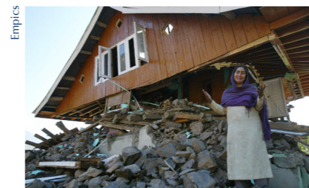
Four million people were directly affected by the Kashmir earthquake in 2005

consumption, weight, height, waist circumference (in men only), blood pressure and medical history. Since then, participants have been followed up for cause-specific mortality. The study will provide evidence about risk factor-disease relationships in South India.