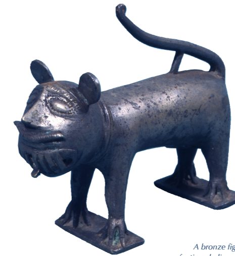
A bronze figure of a tiger, believed to be a bhutu (spirit). Mid 19th century. Pitt Rivers Museum

Oxford University has made strengthening its relationship with India a priority. Through new posts, scholarship programmes, and academic collaboration, Oxford is committed to expanding and invigorating the connections with India that have enriched the University's intellectual heritage for more than 400 years.