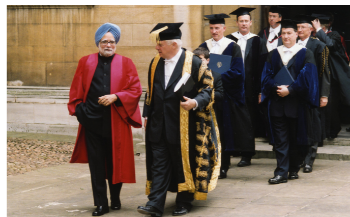
Dr Manmohan Singh, Prime Minister of India, in conversation with the Chancellor of Oxford University, Lord Patten of Barnes, after receiving his honorary Degree of Doctor of Civil Law